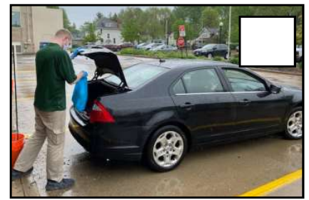
Visit the library to pick out books or use Curbside Pickup