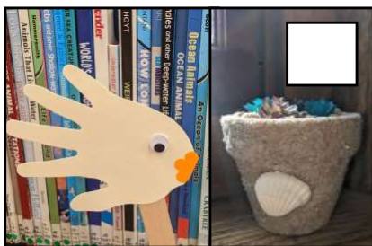
Pick up one of our Take & Make Craft Kits