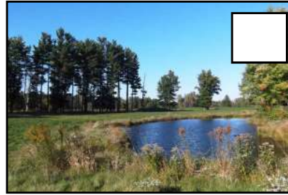
Visit a county Metropark