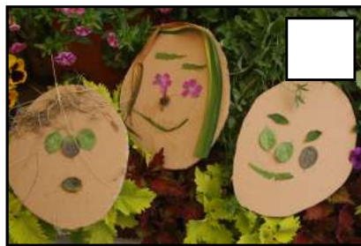
Create a "nature self portrait" with leaves, sticks, and/or flowers