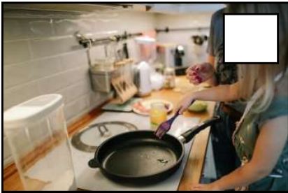
Try out a new recipe