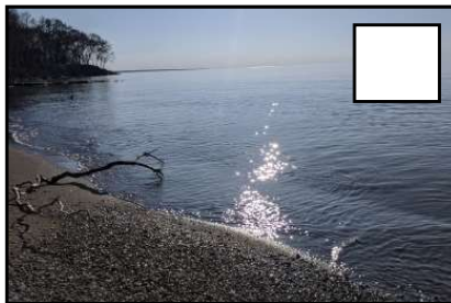
Visit the beach