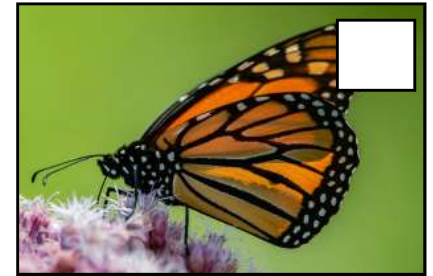
Find something orange in nature