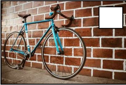
Enjoy a bike ride