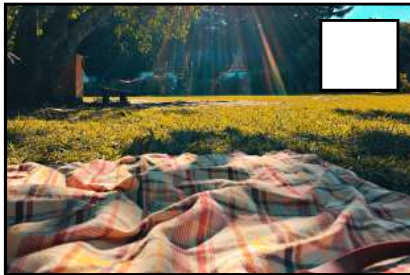
Go on a picnic