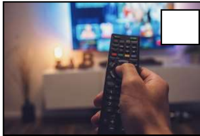
Binge watch a forgotten favorite