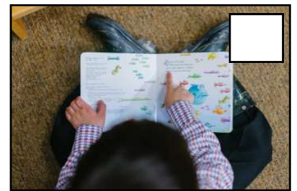
Read out loud to each other or to a pet