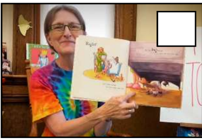
Watch one of our virtual programs (storytime, origami, yoga, and more!)