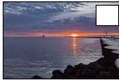
Watch a sunset