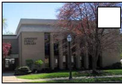
Take a selfie or a family photo outside the library