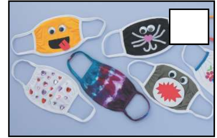
Decorate a mask