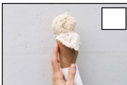
Treat yourself to an ice cream cone