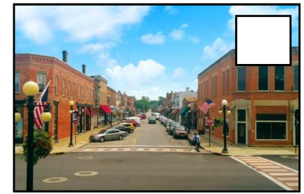
Take a 20 minute walk around town