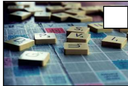
Play a board or card game

After you check off all of the activities, write down your name and phone number and drop this sheet off at the library by Saturday, August 22.