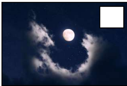
Go star and moon gazing

Complete on your own or make it a challenge for the whole family!